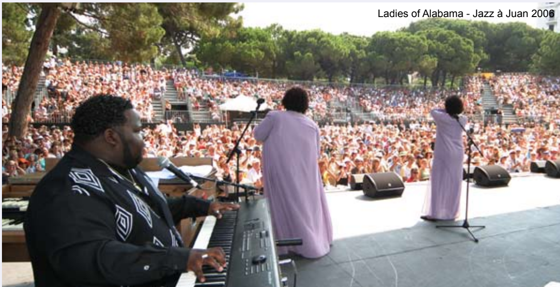
Ladies of Alabama - Jazz à Juan 2006