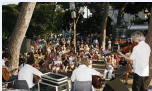
Petite Pinède - Jazz Off 2008