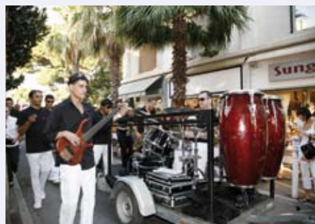
In the streets of Juan-les-Pins - Jazz Off 2008