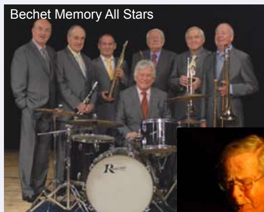
Bechet Memory All Stars